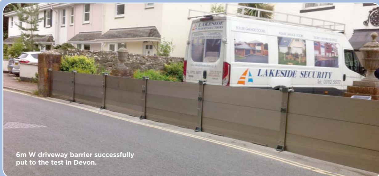
6m W driveway barrier successfully put to the test in Devon.

Our credibility as a company along with our system's market-leading features have resulted in us establishing a very prestigious client base.