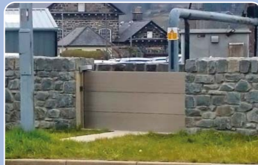
Lakeside barriers protect 300 homes and businesses in National Resources Wales £5 million flood protection scheme in Ddolgellau.